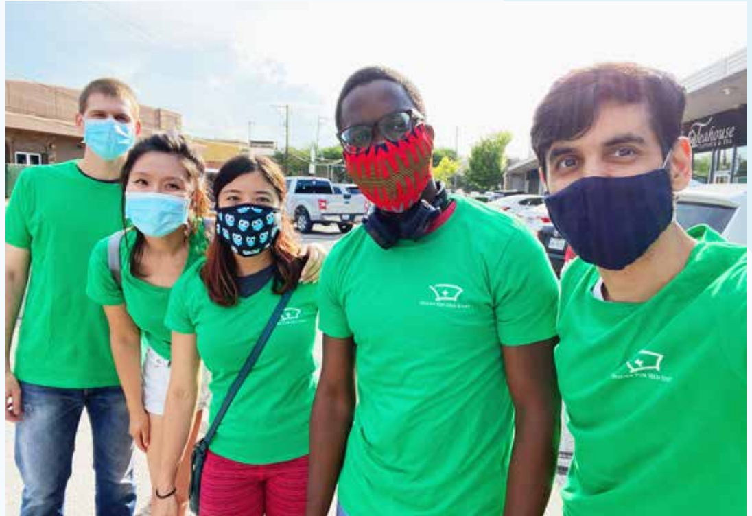
SERVING OF SUPPORT: Rice MBA students provided snacks to medical staff as way to thank them for combating the pandemic.