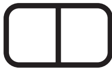
FIGURE 1. H , a solid handlebody of genus 2